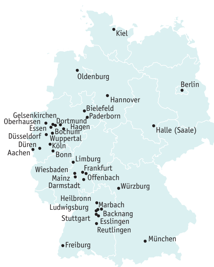
Deutsche Umwelthilfe e.V. is conducting legal actions to enforce Clean Air in these 35 German cities.

On 19 December 2012, the European Court of Justice ruled in relation to air quality plans that even in case of drastic economic consequences, measures can be demanded of Member States, if they are necessary to take account of the limit values. The Italian government tried to justify the continuing breach of the PM 10 limit value in many Italian regions by stating that the objective of compliance could not be achieved. This would have required "drastic measures at economic and social level" and a "violation of fundamental rights and freedoms". In this argumentation, the ECJ did not recognise any justification for exceeding the limit values and stressed that the Member States must comply with the deadlines 9 .