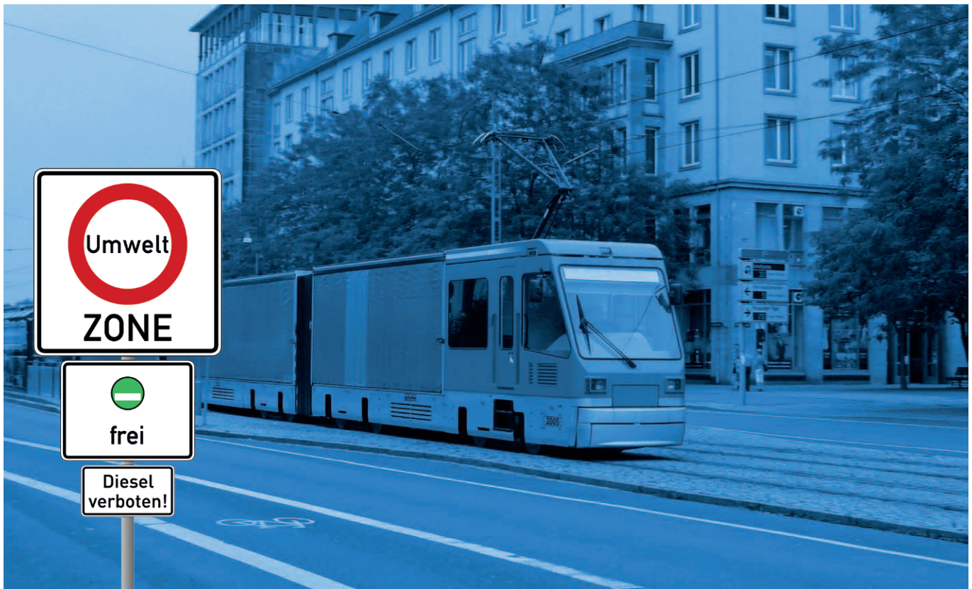
The fastest way to comply with the air quality limits is to ban diesel vehicles in the concerned cities.

In other Member States, environmental associations are also compelled to legally enforce compliance with air quality standards. In 2011, for example, ClientEarth filed a lawsuit against the United Kingdom for non-compliance with NO 2 limits in 16 British cities and regions. With its judgement of 19 November 2014, the European Court of Justice ruled (C-404/13) that national courts are obliged to take any necessary measure against the responsible authorities when air quality limits are exceeded. The UK Supreme Court ruled that the UK government must submit new and effective air quality plans by 31 December 2015. However, these proved to be less effective and did not provide for compliance with limit value before 2025, whereupon ClientEarth filed a complaint again.